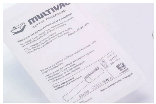
Medical Device package with Tyvek® lidding